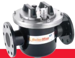
BoilerMag XT (filter to suit 2"-12" pipes)

Eclipse Tools North America Inc 442 Millen Road Unit #9, Stoney Creek, Ontario, L8E 6H2 T 1-800-260-2124 F 1-800-260-1410 sales@eclipsetoolsinc.com www.boilermag.com