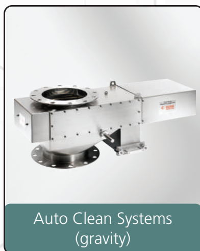
Auto Clean Systems (gravity)

Atlas Way, Sheffield, S4 7QQ, England T +44 (0)114 225 0600 W eclipsemagnetics.com E sales@eclipsemagnetics.com