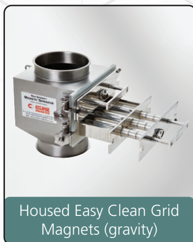
Housed Easy Clean Grid Magnets (gravity)