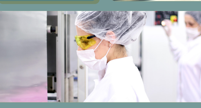
Full in-house manufacturing facilities.

Multiple in-house testing facilities from factory to warehouse.