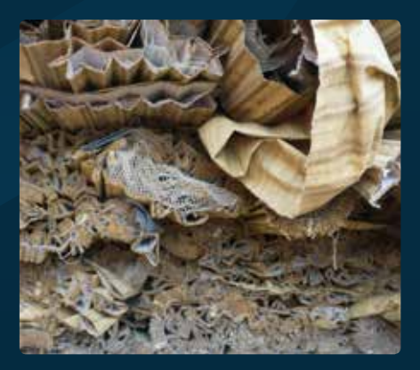
Traditional barrier or cartridge filters require regular replacement resulting in high OPEX, from waste disposal costs which require specialist equipment and procedures.

Black powder causes abrasive damage to critical rotating equipment such as Compressors and Pumps, resulting in costly repairs, replacement costs, downtime, and lost production.