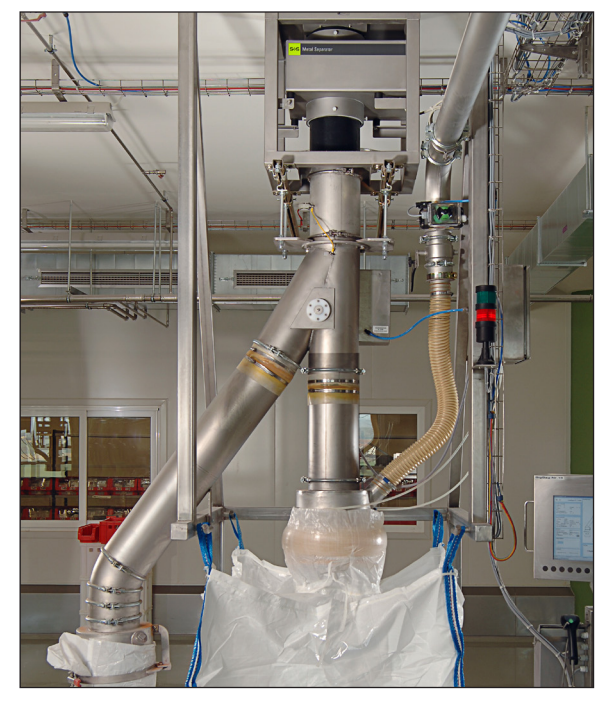
Installation example: IFS compliant metal detection directly before the filling of spice products into bigbags. (old version)