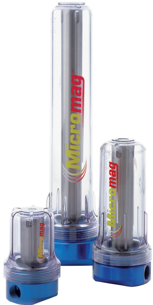
Magnetic circuit & fluid flow path.